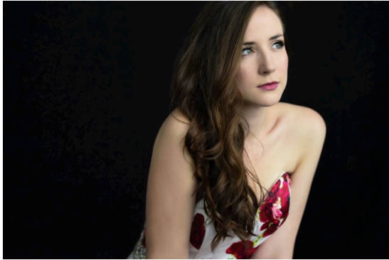
Visit astralartists.org to download hi-res images of this artist.