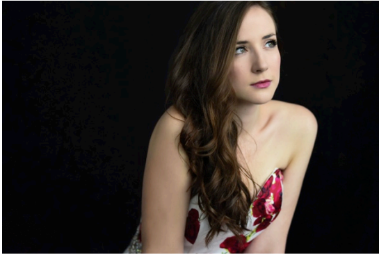
Visit astralartists.org to download hi-res images of this artist.